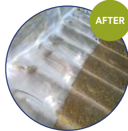
RESTORED AND PROTECTED LEADWORK