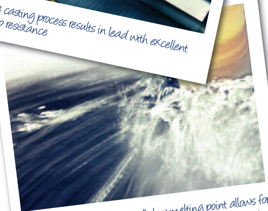
Lead's low melting point allows for energy-efficient processing

Through a computerised process, controlling the depth of immersion and the speed of rotation of the drum, Midland Lead is able to produce lead sheet conforming to customers' specifications - thicknesses between 0.44 up to 3.55 mm.