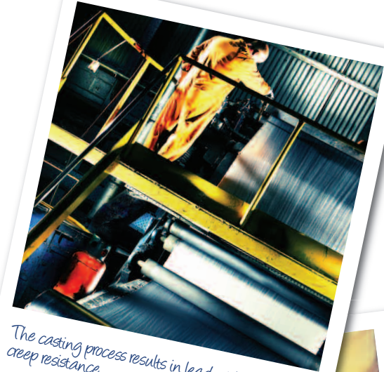
The casting process results in lead with excellent creep resistance